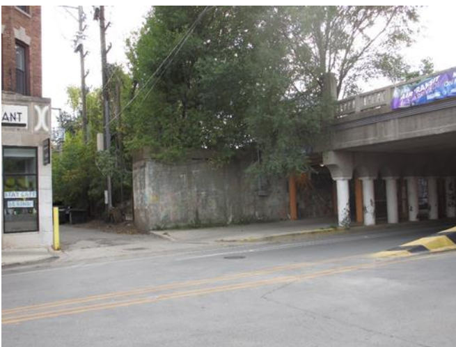
Site #1: 1601 E 55th Street (SE Corner)