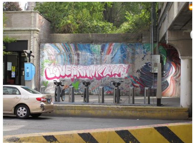
Site #2: 1601 E 53rd Street (SE Corner)